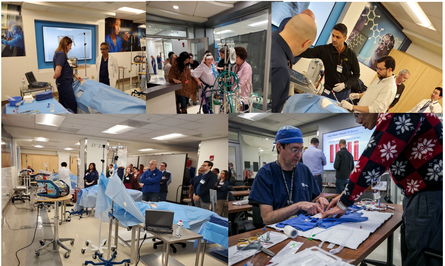
Scenes from previous UK HealthCare ECLS Conferences